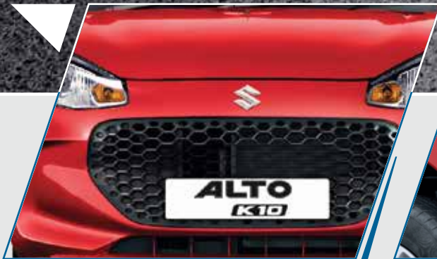
YOUTHFUL, CONTEMPORARY DESIGN WITH HONEYCOMB GRILLE

Now experience the feeling of accomplishment with a special companion, Alto K10. It offers remarkable looks with a great combo of style and modernity.