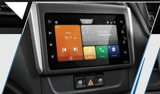
SMARTPLAY STUDIO WITH SMARTPHONE NAVIGATION

The All-New Alto K10 comes with modern interiors; updated technology; and a perfect blend of comfort and practicality.