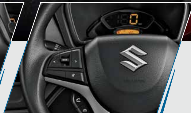
STEERING-MOUNTED AUDIO AND VOICE CONTROL