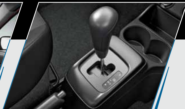
AUTO GEAR SHIFT TECHNOLOGY