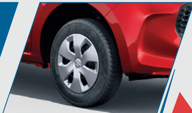
13"(33.02CM) WHEELS WITH HONEYCOMB-THEMED COVERS