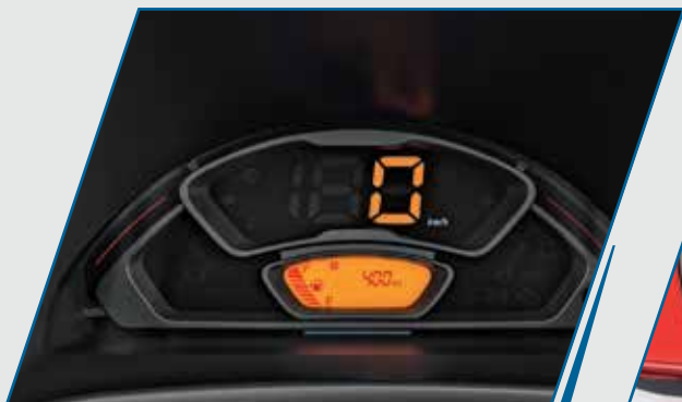
SPEEDOMETER WITH EXCITING DIGITAL SPEED DISPLAY