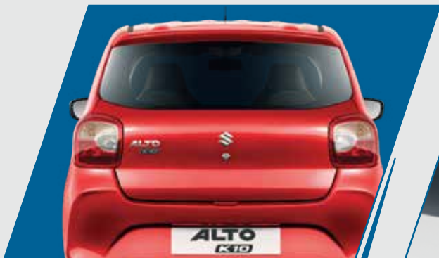
TRENDY REAR COMBINATION LAMPS