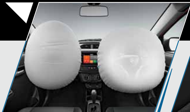
15+ SAFETY FEATURES INCLUDING DUAL AIRBAGS##

*As certified by test Agency under rule 115(G) of CMVR 1989.