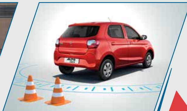
REVERSE PARKING SENSORS