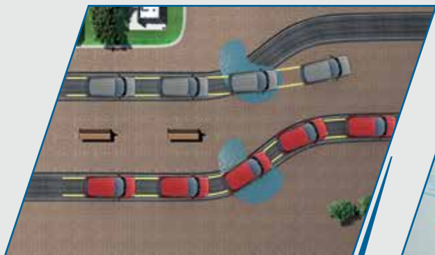
ABS WITH EBD